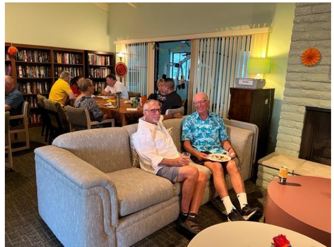
Photos from the Cinco de Mayo Party