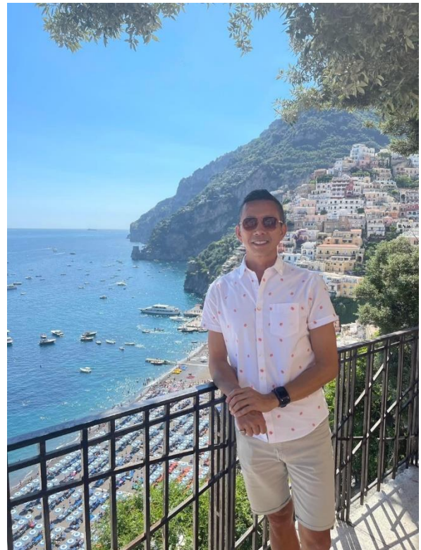
Can we join you Tau? So beautiful.